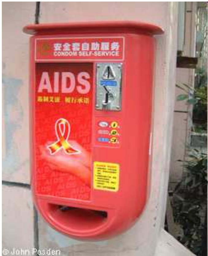
A condom vending machine in Shanghai, China