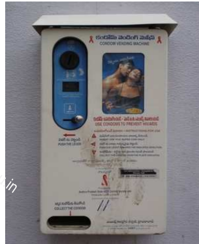
A condom vending machine in Hyderabad, India